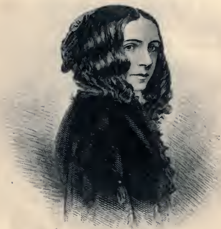
ELIZABETH BARRETT BROWNING.